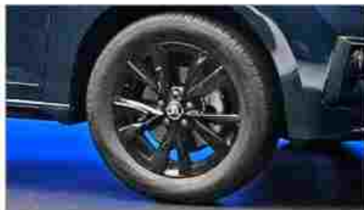
» R16 Black Alloy Wheels