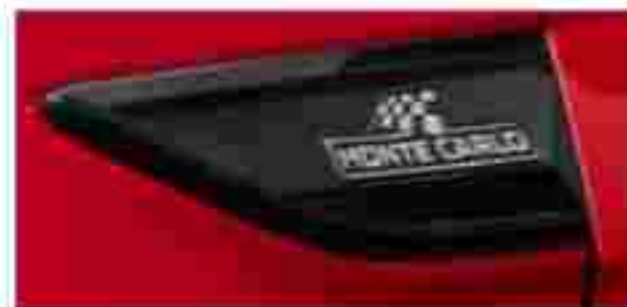
» Exclusive Monte Carlo Badging