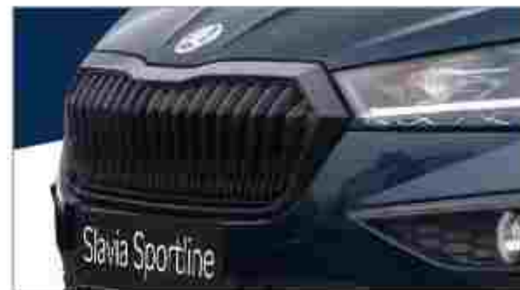
» Black Škoda Signature Grille