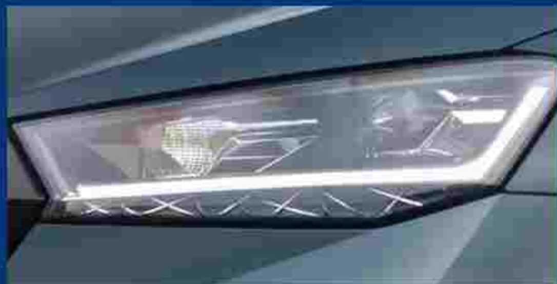
»» LED Headlamps with DRLs