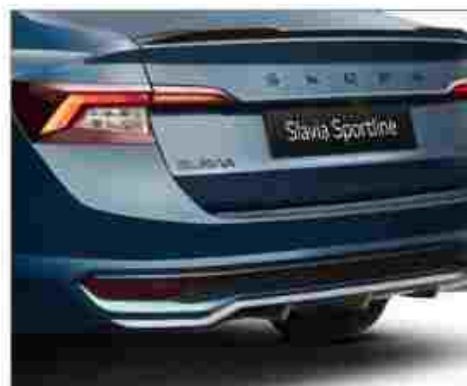
»» Sporty Black Exterior Package