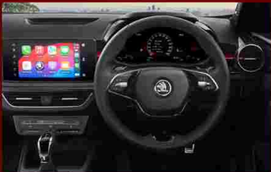
»» 20.32 cm Škoda Virtual Cockpit with Red Theme