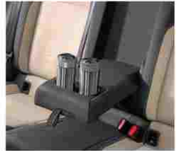
Cupholders In The Armrest