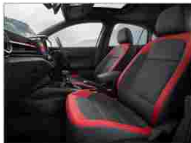
»» Monte Carlo Inscribed Ventilated and Electric Front Leatherette Seats