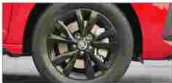
» R16 Black Alloy Wheels