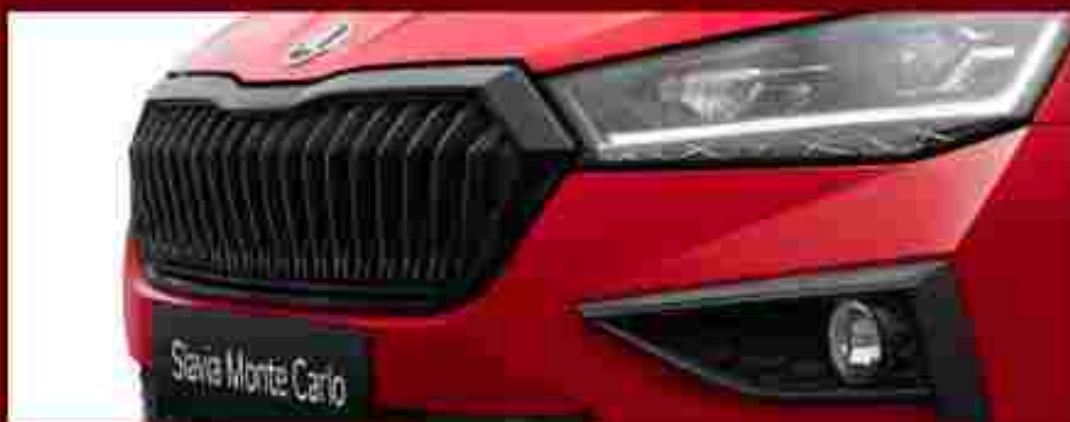
»» Black Škoda Signature Grille