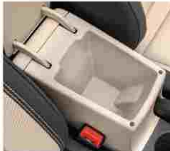
Storage In Front Centre Armrest