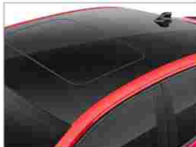
»» Dual Tone Electric Sunroof