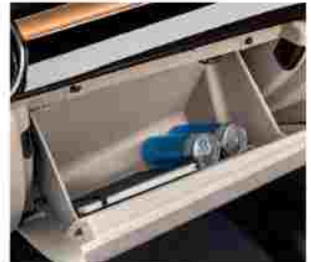
Cooled Glove Box