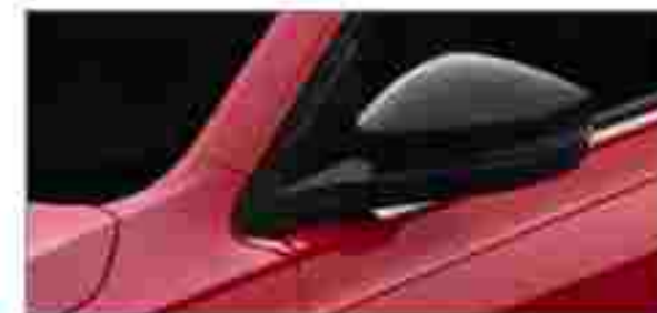
» Glossy Black ORVMs