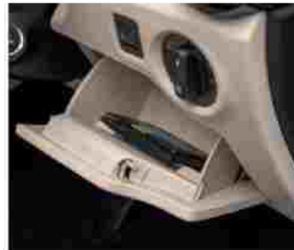
Driver Storage Compartment