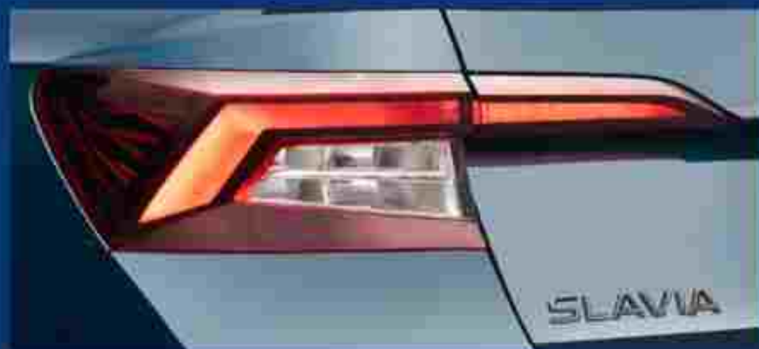
»» Darkened LED Tail Lamps