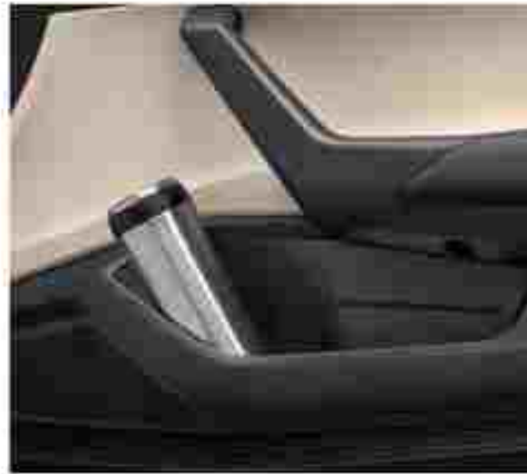
Storage In Front And Rear Doors

Never compromise on boot space. Shoda Drive sets the standard with best-in-class storage – 523 litres with rear seats up, and a whopping 1000 litres when folded down.