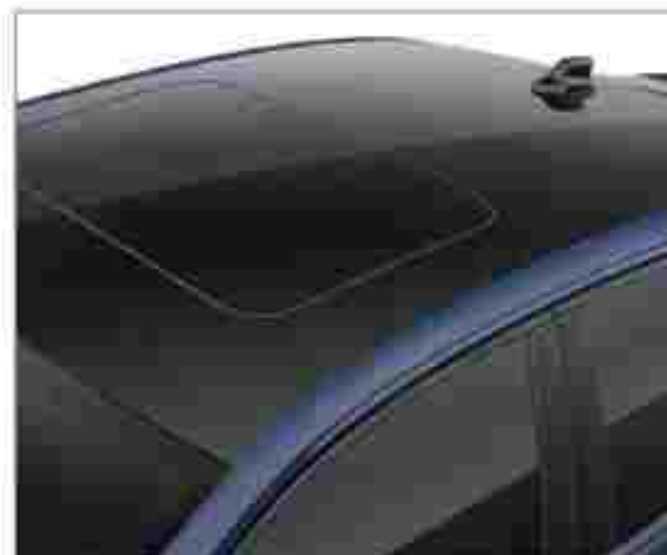
»» Dual Tone Roof with Electric Sunroof