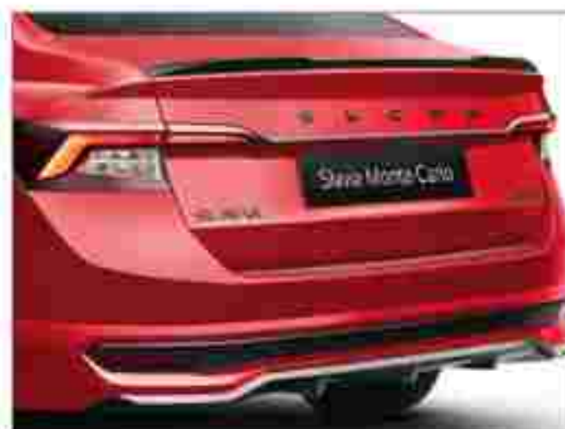
»» Sporty Black Exterior Package