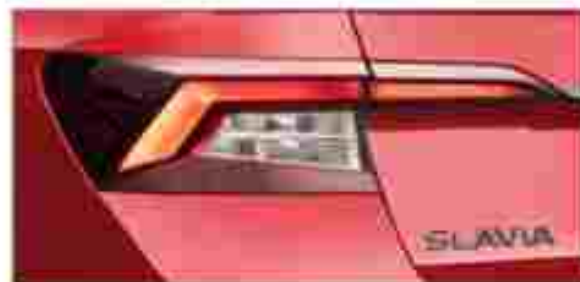
» Darkened LED Tail Lamps