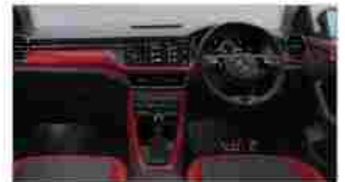
» Red Ambient Lighting