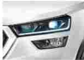
LED Head Lamp & Front Fog Lamp