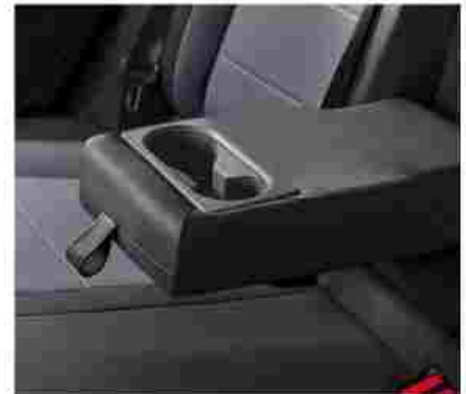
Cupholders In Armrest