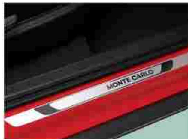
»» Premium Monte Carlo Scuff Plates