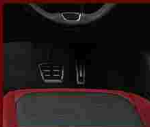
»» Alu Pedals