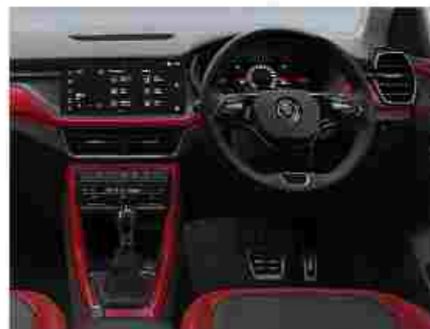
»» 20.32cm Škoda Virtual Cockpit with Red Theme