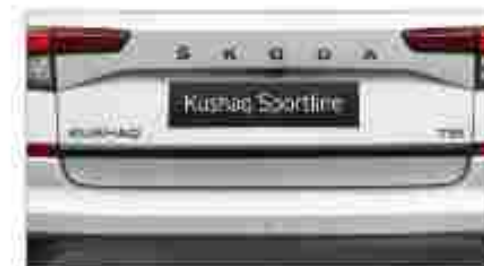
» Sporty Black Exterior Accents