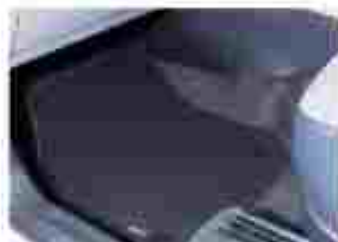
Premium Textile Mats