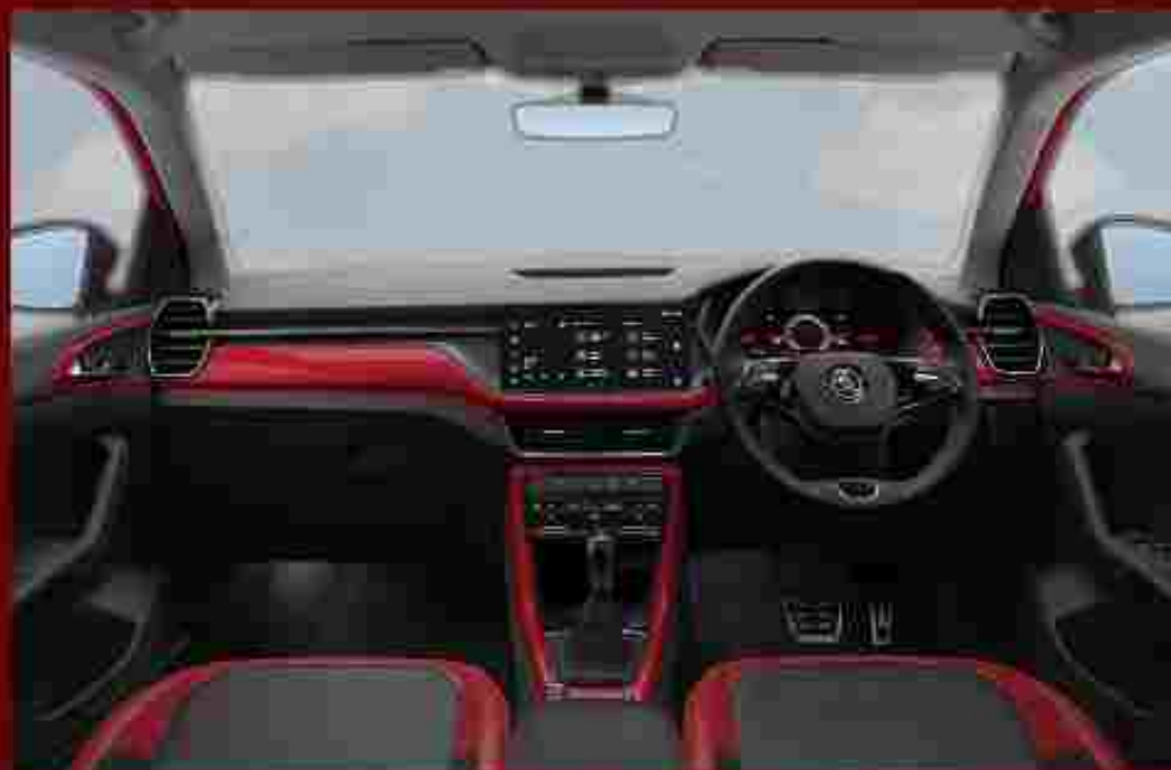
»» Red Themed Dashboard