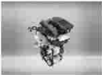
1.0 TSI Engine