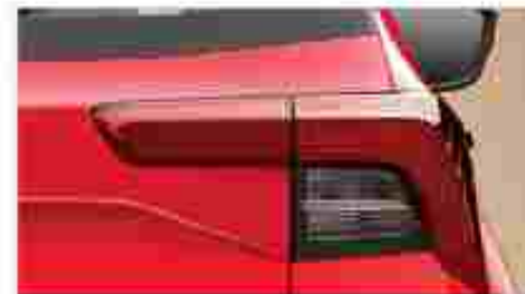
» Darkened Tail Lamps