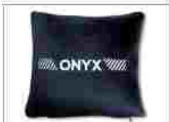
Memory-foam Cushion Pillows with Onyx Inscription