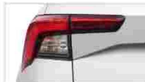
» Darkened Tail Lamps