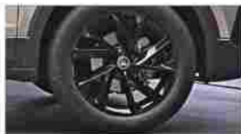
» R16 Black Alloy Wheels