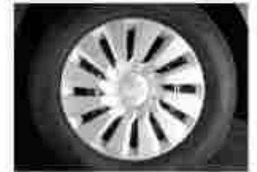
Steel Wheels R(16) + Wheel Cover, Tecton