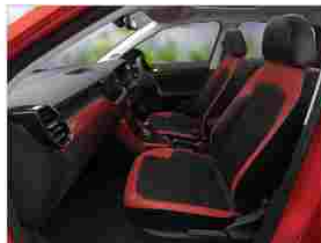
»» Monte Carlo Inscribed Ventiladed Leatherette Seats with Red Stitching