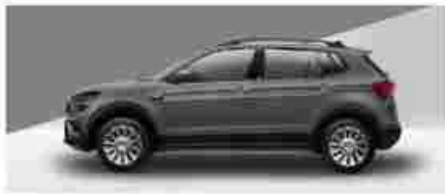
Kushaq Onyx - Carbon Steel