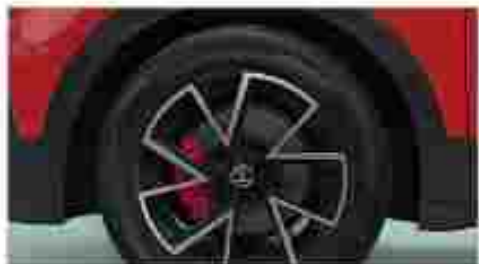
» R17 Dual Tone Alloy Wheels with Red Calipers