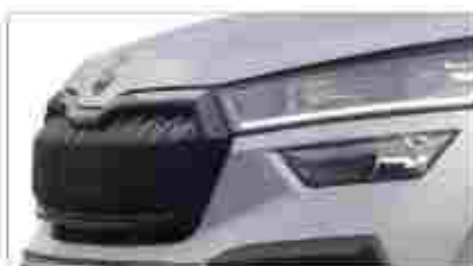
» Black ŠKODA Signature Grill