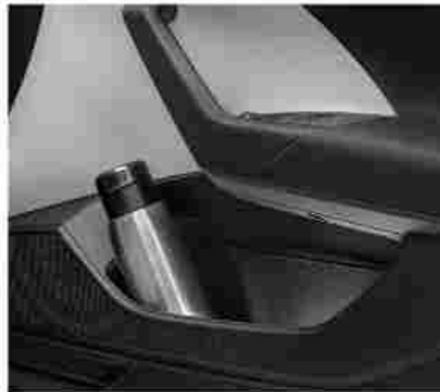
Storage In the Front and Rear Doors