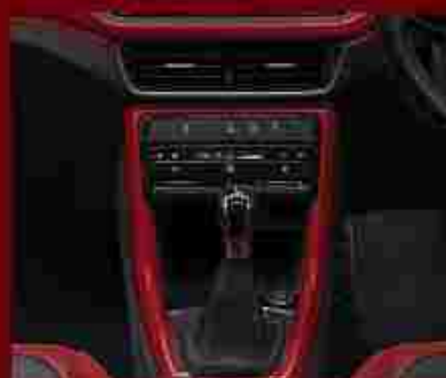
»» Black DSG Gearbox