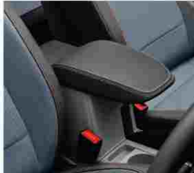
Storage In Front Centre Armrest