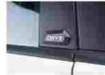
Onyx Badge on B-Pillar