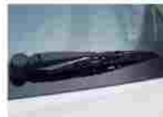
Rear Wiper & De-fogger