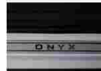
Onyx Inscribed Front Scuff Plates