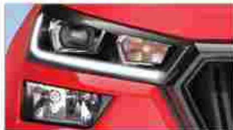
» Headlamps with DRLs