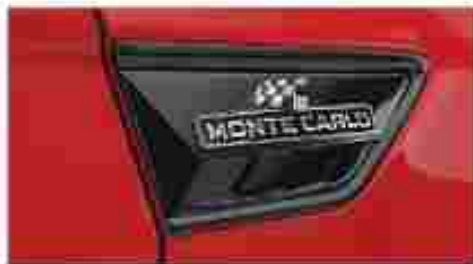
» Exclusive Monte Carlo Badging