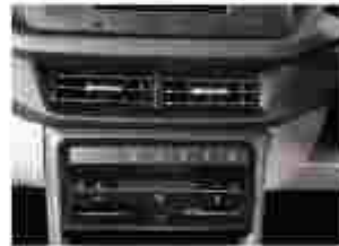
Climatronic Auto A/C