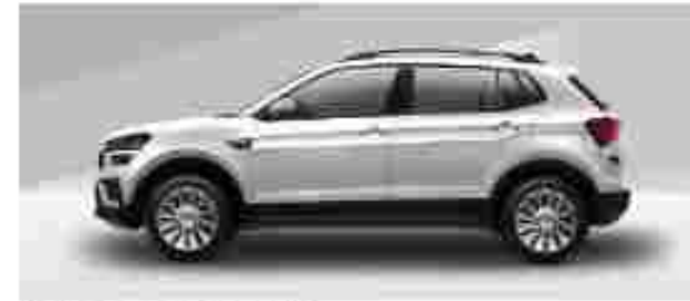
Kushaq Onyx - Candy White