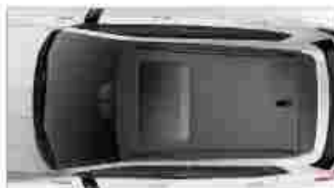
» Dual Tone Roof with Electric Sunroof